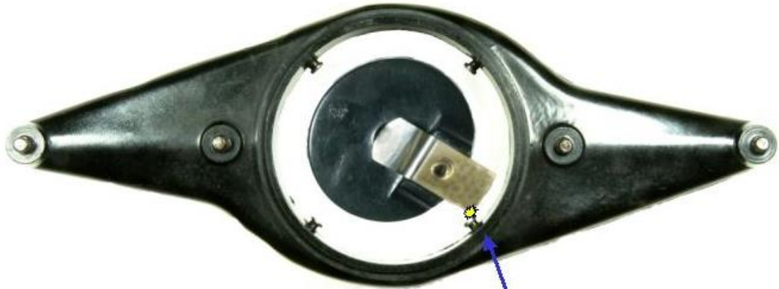
Nr 1 Sparkplug Contact