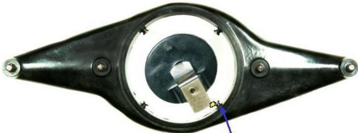
Nr 1 Sparkplug Contact